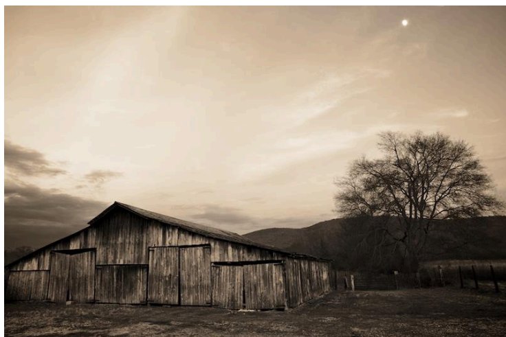
Monochrome Print by Tom Hix